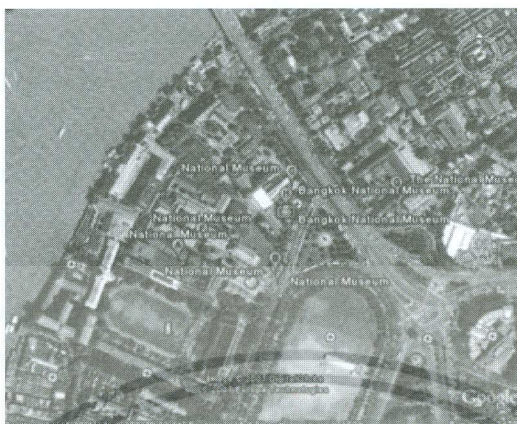
Figure 1: Picture of Wang Na.