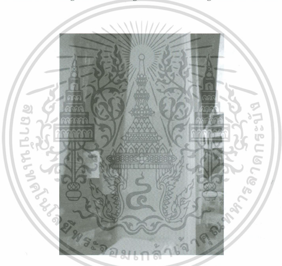
Figure 3: This picture shows the deterioration inside Wat Bavornsataan Suttawas.

เอกสารนี้เป็นเอกสารที่สงวนไว้สำหรับการใช้งานเพื่อการศึกษาเท่านั้น ไม่อนุญาตให้นำไปใช้ประโยชน์ด้านการค้า ไม่ว่ากรณีใดๆ ทั้งสิ้น อีกทั้งห้ามมิให้ตัดแปลงเนื้อหา และต้องอ้างอิงถึงเจ้าของเอกสารทุกครั้งที่มีการนำไปใช้